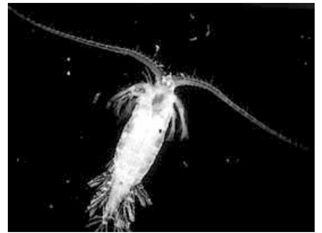
Copepod- The most abundant type of zooplankton in the world's oceans.

In Bermuda, Steinberg focused on the vertical migration of zooplankton in the Sargasso Sea. Many zooplankton and fish that live in deep waters of the ocean during the day migrate up to the food-rich surface waters at night to feed under the cloak of darkness, which helps conceal them from visual