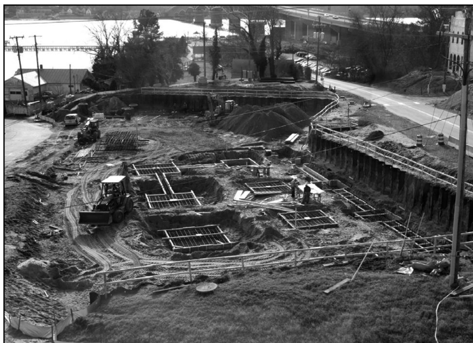
Workers prepare the footers to be poured for Andrews Hall.