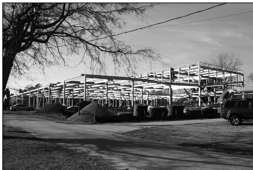
Steel framing for VIMS' new Seawater Laboratory is now in place.