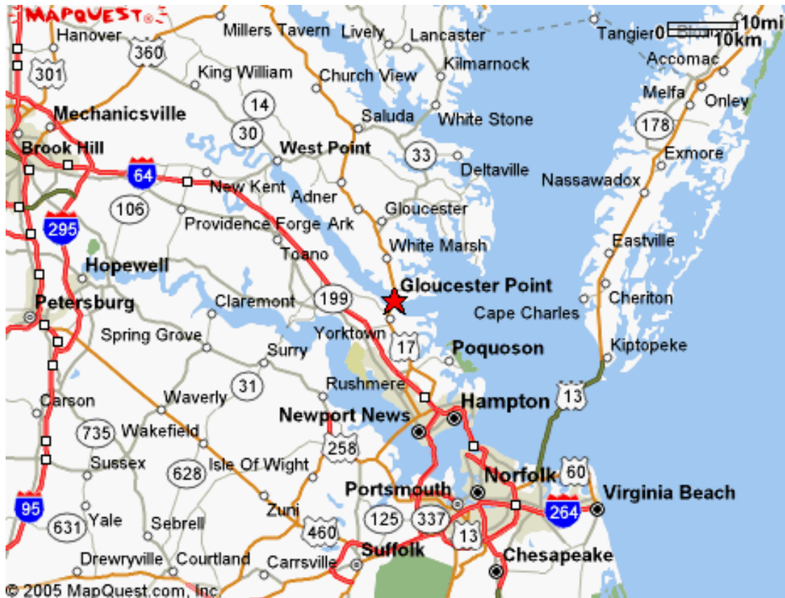
Gloucester Point Map: Larger Scale

VIMS address: Route 1208 Greate Road Gloucester Point, VA 23062