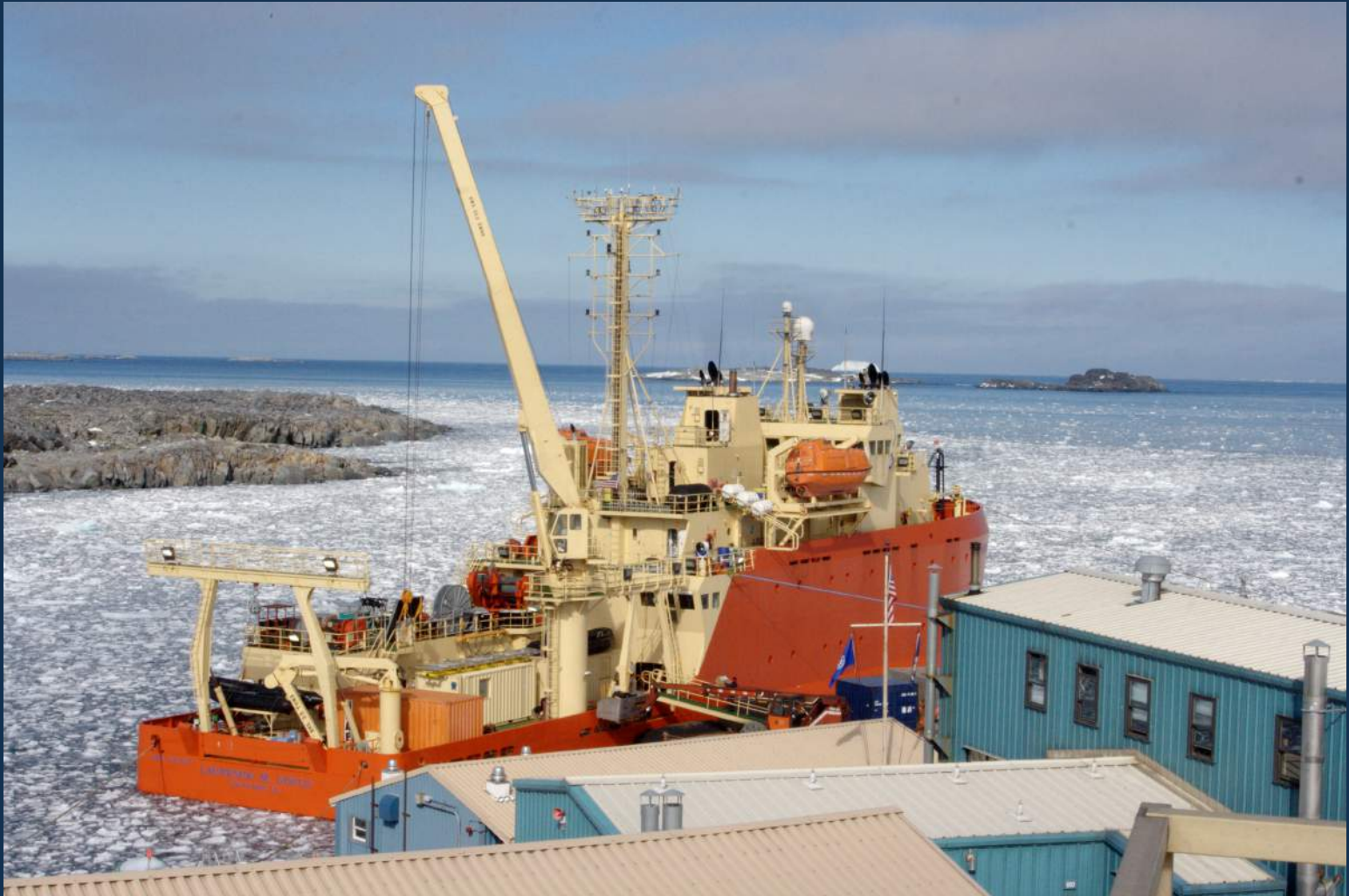
Home Sweet Home - ARSV Laurence M. Gould