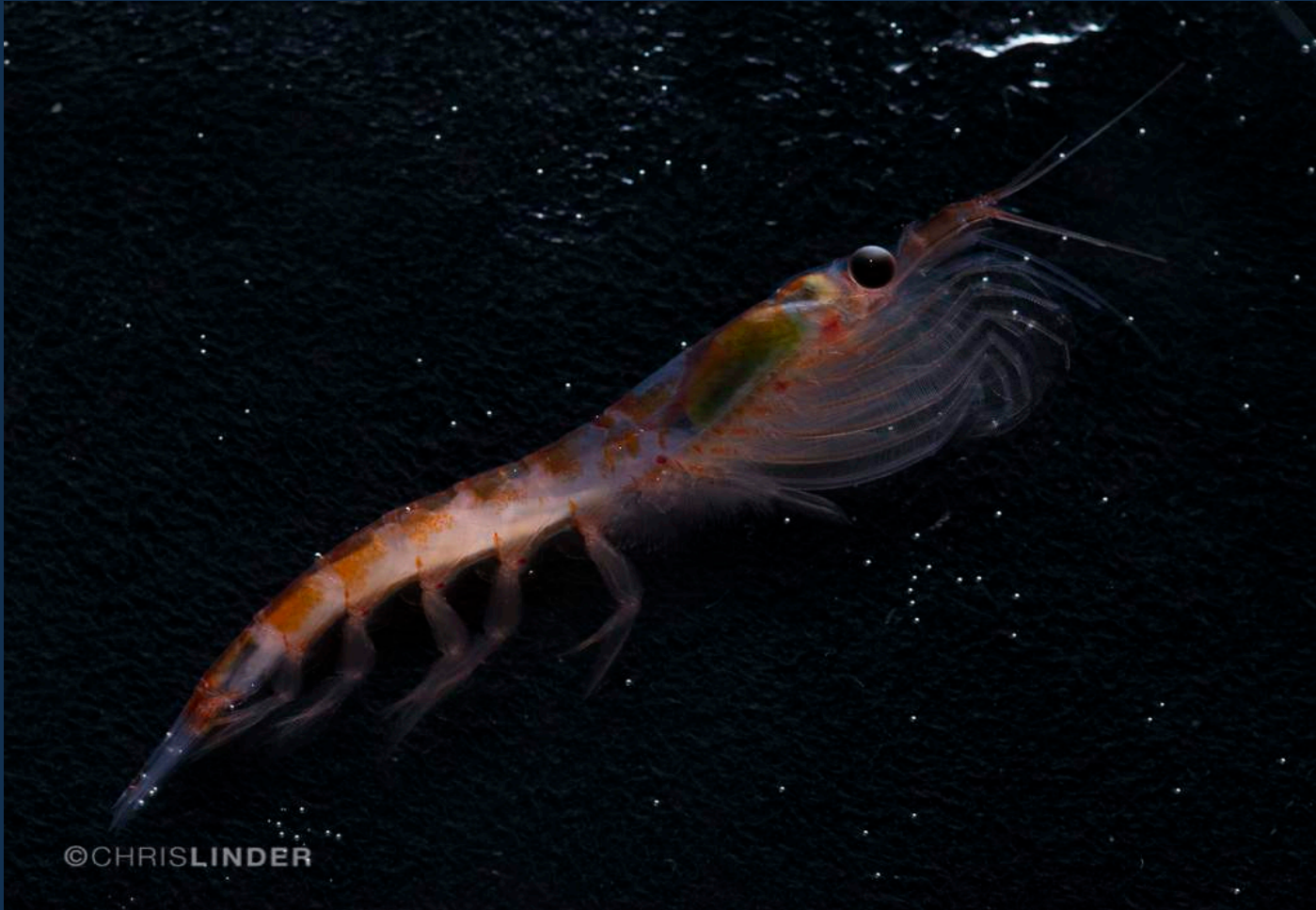
Euphausia superba – The Antarctic Krill