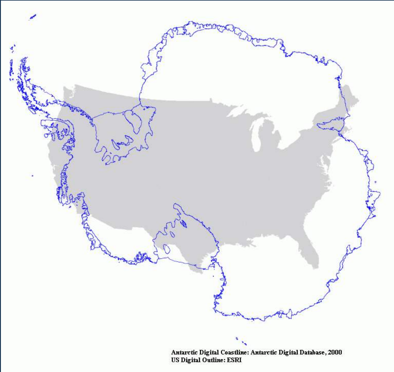
Antarctic Digital Coastline: Antarctic Digital Database, 2000 US Digital Outline: ESRI