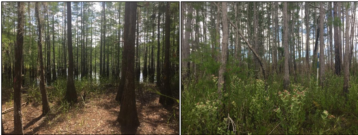
Figure 3-4: Two wetlands being considered for the field-study where managers may categorize the left wetland as healthy and the right as impaired based on inundation periods and wetland species presence, while residents may categorize both as healthy.

Objective 3: Evaluate predictors of resident perceptions about wetland health and engagement with water management decision-making including demographic factors and proximity to wetland degradation. Through this study, I can better understand what drives resident’s understanding of wetland health and potentially what leads them to engage with managers or other residents in wetland protection. This final study will utilize resident interviews collected and archived by the University of South Florida that include both qualitative and quantitative responses. Through collaboration with local water management agencies and non-profits, these data can also be supplemented with information for residents that attend public