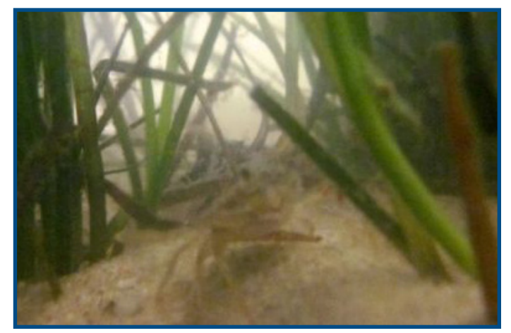
In the Grass: Thicker seagrass beds provide better nursery habitat for juvenile blue crabs.

A new study by researchers at the Virginia Institute of Marine Science refines that knowledge, showing that it's not just the presence of a seagrass bed that matters to young crabs, but also its quality—with denser beds holding exponentially more crabs per square meter than more open beds where plants are separated by small patches of mud or sand.