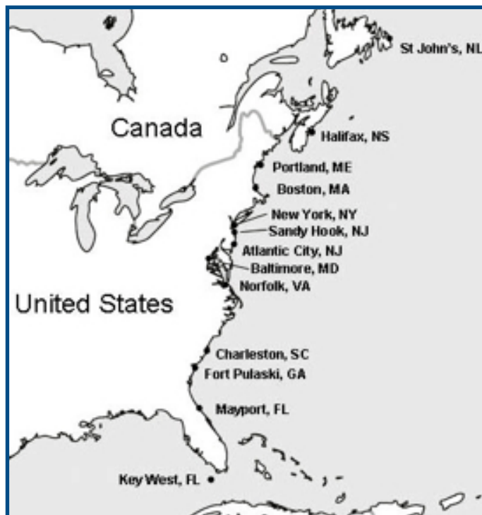
Location of tide stations on the Atlantic coast of North America. Sea-level data for U.S. tide stations are collected and distributed by NOAA's National Ocean Service.