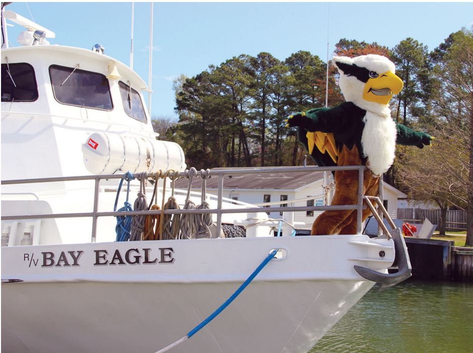
The Griffin reenacts his favorite scene from the movie Titanic aboard the R/V Bay Eagle for One Tribe One Day 2015.