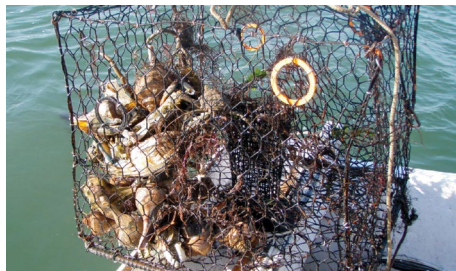
A recovered derelict crab pot from the Eastern Shore filled with blue crabs and whelks.