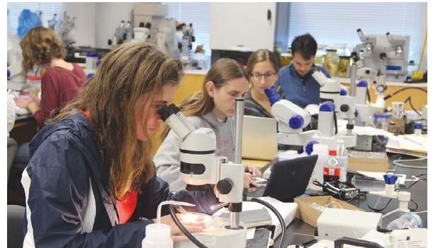
Participants learn the study, identification, and care of specimens representing the earliest life stages of bony fishes.

The specimens in the larval fish collection were sampled serendipitously during one-time and recurring zooplankton studies in oceans around the world. These field projects—including long-term time series in the subtropical Atlantic and Southern oceans, and comprehensive studies of how physical features such as mesoscale eddies and the Amazon River plume affect plankton distribution—represent some of the largest investments the