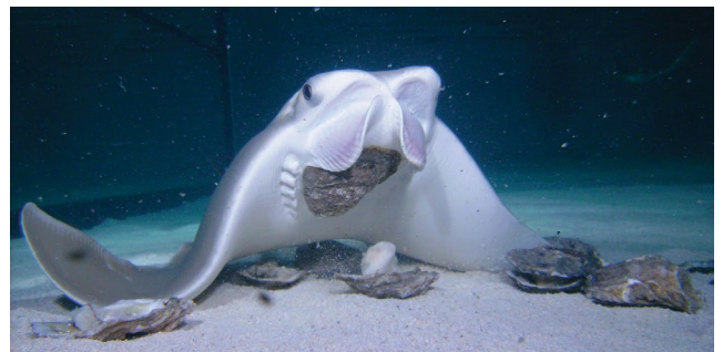
A cownose ray feeding on oysters.

“... reconsider the related campaign in the Chesapeake Bay region to ‘Save the Bay, Eat a Ray.’”