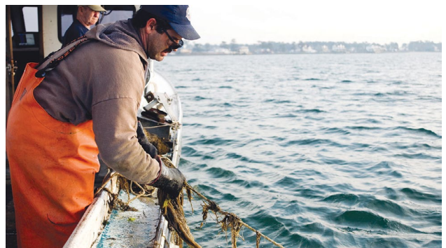
A waterman retrieves a derelict crab pot using a tow rope that is studded with hooks to snag the crab pot's mesh sides.

The researchers' analysis shows that the program was a sound investment, with its $4.2 million price tag over 6 years easily recouped by the extra $21.3 million in blue crab revenues earned.