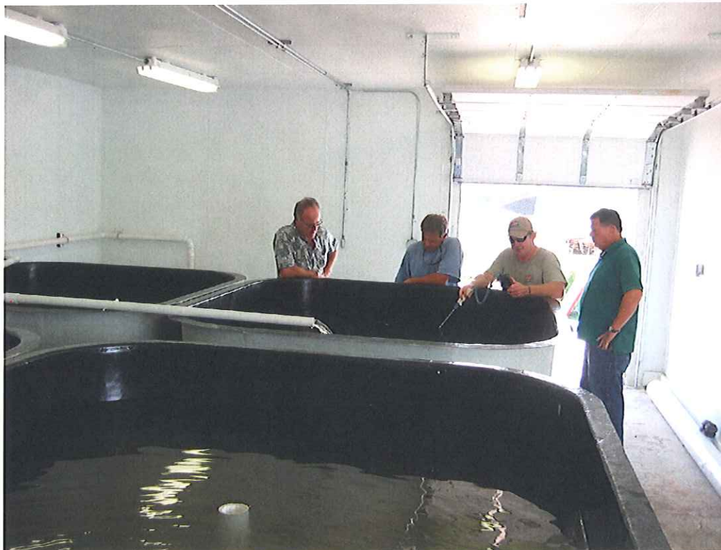
Four tanks were installed in a bright room whose walls could be washed.

A storage room at Casey's Seafood, located at the small boat harbor in Newport News, was renovated to accommodate four fiber glass tanks, which came from Steve Wolfe Industries, Jamesville, N.C. The room was rewired in order to have adequate current to run pumps and regenerative blowers along with the possibility of electrical heating of water. The new wiring included three phase circuits.