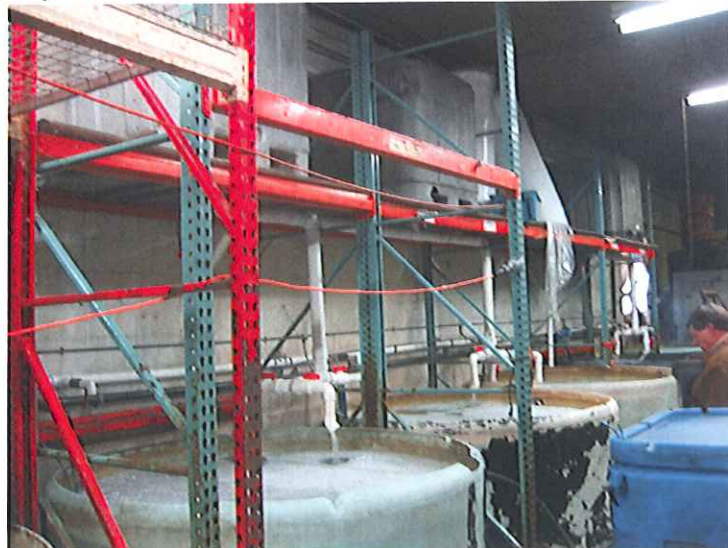
Fish holding tanks in the Brooklyn warehouse of New Hing Lee.

He uses fork lifts to load Bonar boxes on to his flat bed trucks. Water in the boxes is injected with oxygen while he is hauling fish.