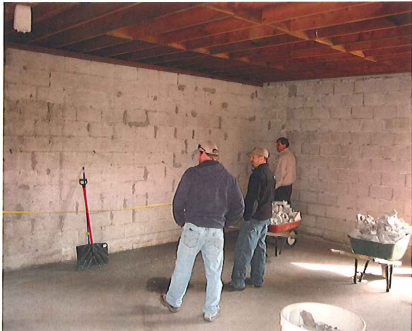
A storage room was stripped to the bare walls and refurbished

However, because of toad mortality at the crab house and invoices that were only partially paid, these efforts, to our knowledge, have either been abandoned or cut back to minimal operations.