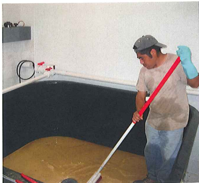
Cleaning a tank.

Packing and shipping: The fish are put into a 50-lb fish box that has a no leak thermal liner. About 20 pounds of fish are put in each box. We cut holes in the liner near the