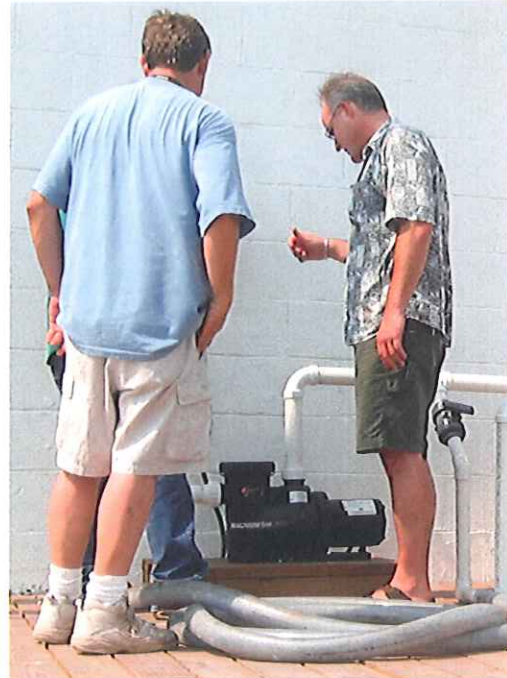
The pump which pulls water from the creek and pushes it through the sand filter

Water was pushed into the tanks along the sidewalls in order to create a circular water flow from the outside of the tank to its center before it exited through a center stand pipe drain. The standpipes had external sleeves with slots at the bottom of the sleeves. This set