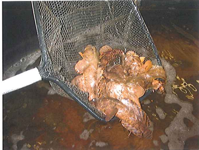
Up close and personal

moist. The liner is sealed and the lid put on the box. The box is then sealed with tape for shipment. The boxes are palletized and put in the cooler until shipment. We ship on one of two trucks that go into New York. The fish are loaded on the truck usually around 3 p.m. daily and arrive in New York around 2 a.m. the next day.