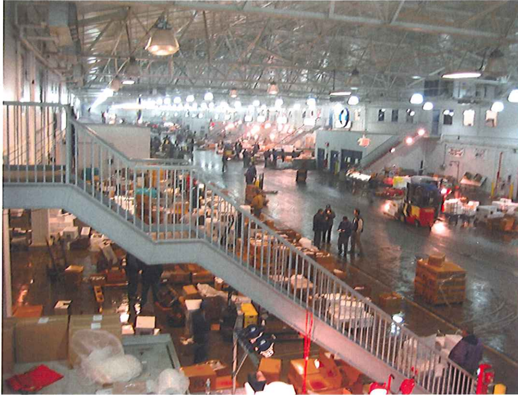
The New Fulton Fish Market at Hunts Point in the Bronx