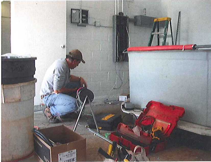
New circuit panel boxes were installed to provide power for water handling needs.

By investing in fiberglass tanks, water filters, air injection, marketing trips, and alternate fishing pots, we sought to overcome these obstacles so that a successful market could be built. Funds from Casey's Seafood and a Fishery Resource Grant financed these efforts.