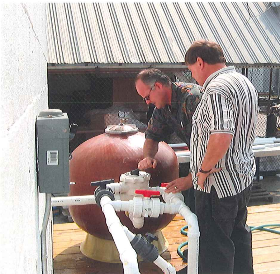
A sand filter was installed with a three-way back-wash valve to prevent the filter from clogging with sediment. During peak production the filter was back-washed daily. The pipes were also valved so that a live haul truck could be loaded with seawater.