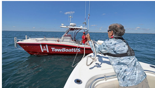
Getting on-water assistance is easy with the BoatUS App, now featuring direct connect for faster response times.

When boats break down on the water, run aground or run out of fuel, many recreational boaters use the free BoatUS App to summon TowBoatUS for routine on-water assistance. The app's new Connect feature will automatically link app users with the closest local TowBoatUS captain, eliminating the need to call to BoatUS national dispatch and providing better service to boaters by shortening response times from the nation's largest 24-hour, on-water towing fleet.