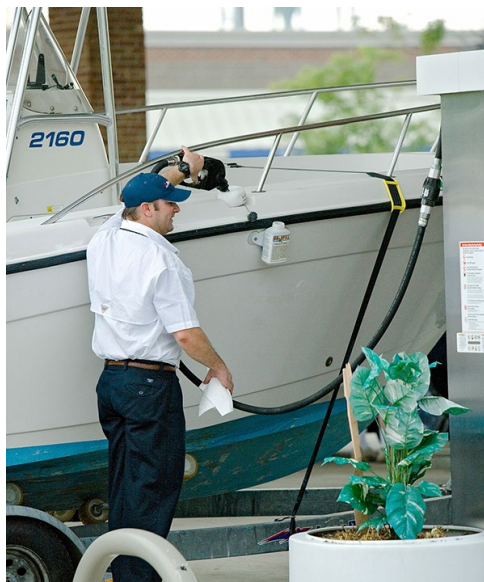
If you refuel your boat at a gas station, be aware that any fuel with more than 10% ethanol (E10) is prohibited for use in marine engines.

This encourages you to keep more midsized fish and release the biggest ones as they're more likely to reproduce next season. Use circle hooks to minimize damage, and do your best never to leave fishing line in the water. Encourage your community's line recycling by making a monofilament fishing line recycling bin and start a recycling program at your boating and fishing club, launch ramp or marina.