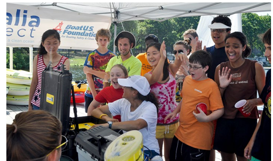
A Grassroots grant helped these youngsters understand marine debris in their own community.

Since 1989, the Foundation has awarded more than $1.3 million to organizations that have developed creative projects to promote safe and clean boating on their local waterways. For more information or to apply, go to BoatUS.org/Grants .